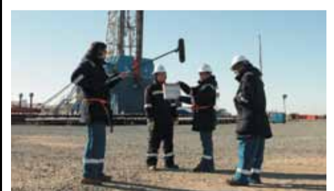
Shooting a film about Tengizchevroil