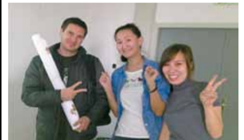
TCO Green Belts become trendy