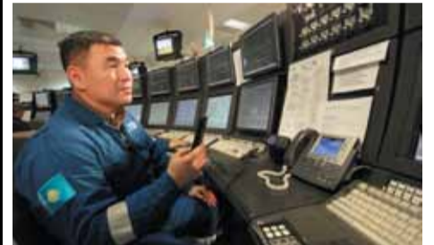
TCO Re-wheels to Reach Another Milestone