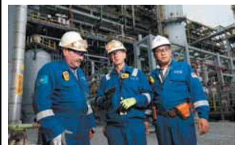
Human behavior and how we can improve IT