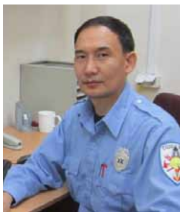
By Zakir Sapikozha, paramedic for TCO Clinic

Cardiovascular diseases remain on top of the list of the most common health problems around the globe. They occur across all social and professional groups, and the statistics look very similar on all continents. We at TCO have a very healthy workforce; however, the heart pain can occur in every human being, even in individuals with ideal health conditions. Therefore, we deem the following recommendations useful to all, without exception. So, the chest pain serves the symptom of a sick condition which causes discomfort with any individual. In the event of acute chest pain most people place an emergency call without hesitation, complaining about bad condition. The causes and progress of heart disease may vary, hence the many diagnoses and prescribed therapy. It is critical to complete an examination and make a correct diagnosis, thus identifying the type of problem and determining the level of danger. Chest pains can be symptoms of many illnesses; therefore it is important that the sick person describe exactly what he feels. The accuracy of a diagnosis depends 50 percent on the description of a