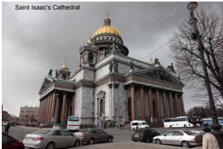
Saint Isaac's Cathedral