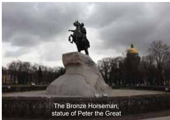
The Bronze Horseman, statue of Peter the Great

The legendary Bronze Horseman is an equestrian statue of Peter the Great in Saint Petersburg, Russia. Commissioned by Catherine the Great, it was created by the French sculptor Étienne Maurice Falconet. The name comes from an 1833 poem of the same the name by Aleksander Pushkin, which is widely considered one of the most significant works of