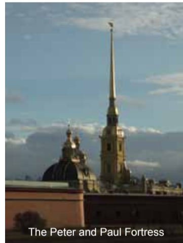
The Peter and Paul Fortress

as we found ourselves in the starting point of our tour – the Palace Square which is the heart of this magnificent city where you can physically sense the pulse of its grandiose history.