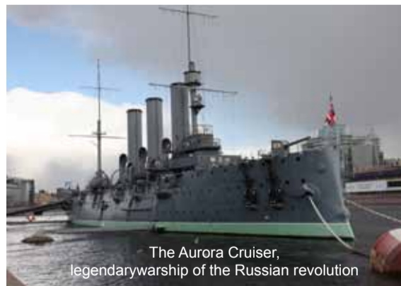
The Aurora Cruiser, legendary warship of the Russian revolution