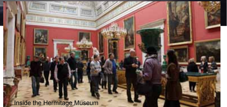
Inside the Hermitage Museum