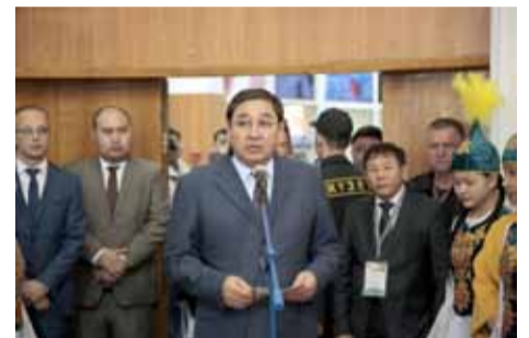
Oil Exhibition in Atyrau