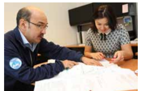
The white sail of creativity