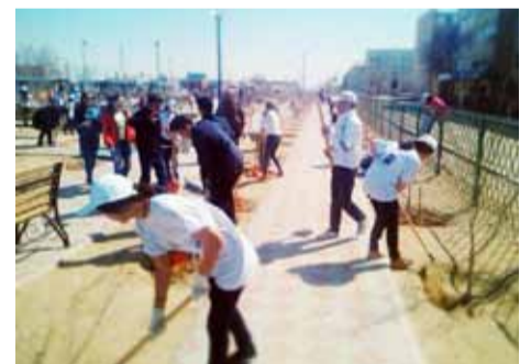
Earth Day in Kulsary