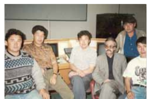
The expanse we refer as life