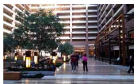
BBS in action the Texas way