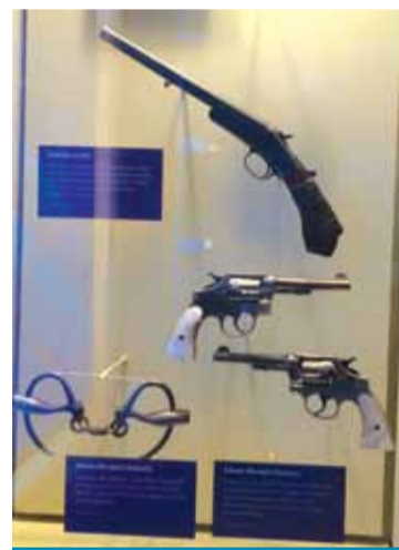
The Old Red Museum telling the history of Dallas;

"Being representative of ESS and member of Infrastructure Leadership Committee, I would like to thank TCO for giving me this precious chance to attend this conference which was deemed by me extremely useful source of information