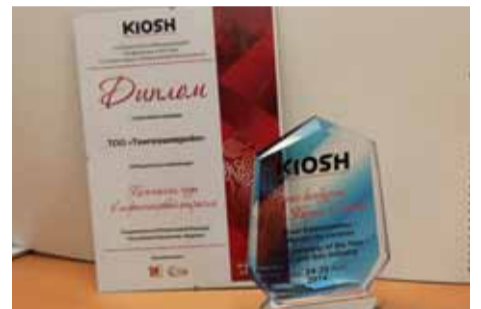
TCO at KIOSH '14 Exhibition and Conference