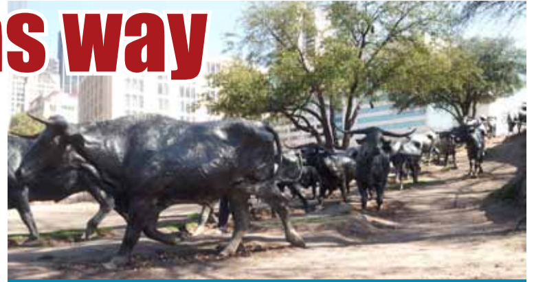
The Pioneer Plaza Park in the heart of the city where you can see 70 larger-than-life bronze steers

been always a very effective tool used to improve the work process. The continuous effort aimed at maintaining the necessary level of safety serves a strong guarantee of keeping any operation successful and fail-safe. At this forum we managed to meet our colleagues from the USA representing groups of operational safety and production operations. I would like to particularly recognize the painstaking effort and no-nonsense attitude many companies in the USA demonstrate investing big time in scientific research of human behavior. It is deemed very important they contribute a painstaking effort to break