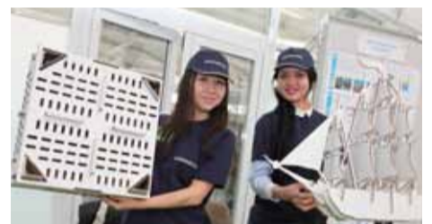
Another CHESM forum