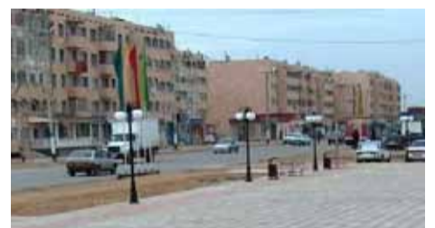
Apartment House Management Issue in Kulsary