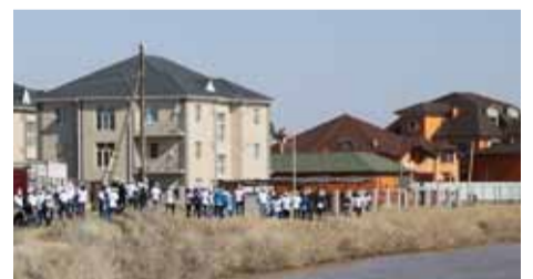
Celebrating World Tree day on the banks of Ural