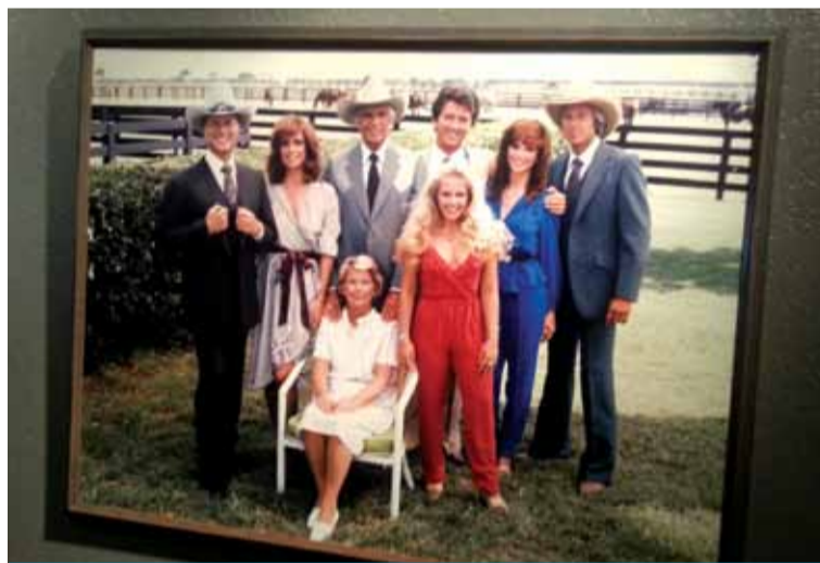
We visited the famous ranch, presently a museum, in the outskirts of Dallas – the place where the famous serial was shot, so much appreciated by our moms back in the 80s of the past Century;

the organization. Thus, each of the five sessions we attended has given us new and valuable knowledge and experience we are planning to apply in the near future to further better the BBS process at TCO.