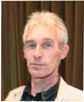
By Viktor Sutyaguin, member of Kazakhstan Union of Journalists, specially for TCO Newsletter

The issue of utilization of the sulfur from the open storage in Tengiz which used to be a concern to local community is nearing a final and happy settlement, as TCO is actively crushing and offloading the commodity from the single remaining sulfur pad. The well thought-out marketing strategy resulting in continual growth of sulfur exports each year allowed for upgrading total sulfur sales at TCO above 3 million metric tones per year, with sales steadily ahead of production.