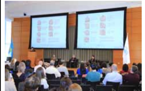
Breast Cancer Awareness