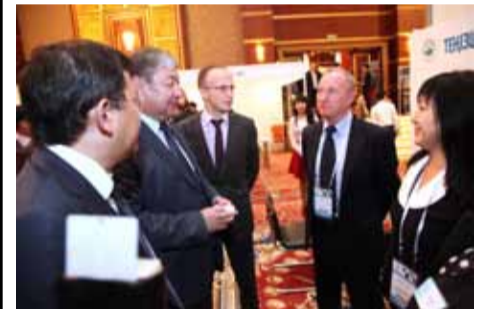
Optimism of cooperation