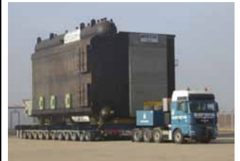
330-ton Cargo Safely Transported through Atyrau