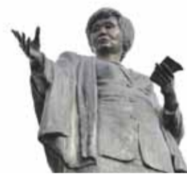
To the Glorious Daughter of the Caspian