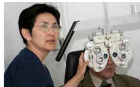
Opening Up a Beautiful World