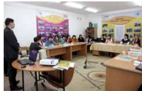
2015 CIP Town Hall Meeting