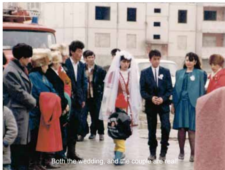
Both the wedding, and the couple are real!