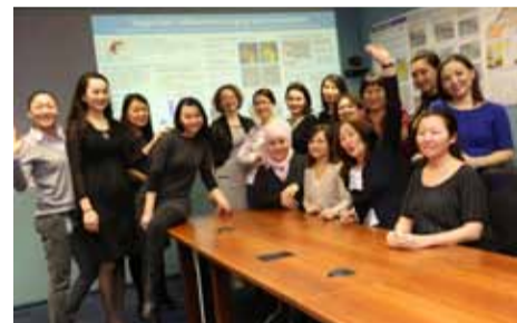
Beauty and Brains